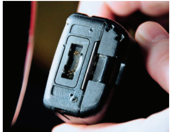
Image shows the bottom of a prototype radio after being dropped onto a bed of nails many times. You can see where the nails have impacted on the radio without bending the pins.

The combination of these two new connectors is a step-up in the ruggedness of the radio, the connectors resist all types of abuse including dirt, rough handling, and long-term corrosion. The fast changing side connector will be a big plus for users who change accessories frequently, sometimes in the dark or underneath clothing. Taken together these connectors greatly enhance the users experience of the MTP3000 Series TETRA Radio.