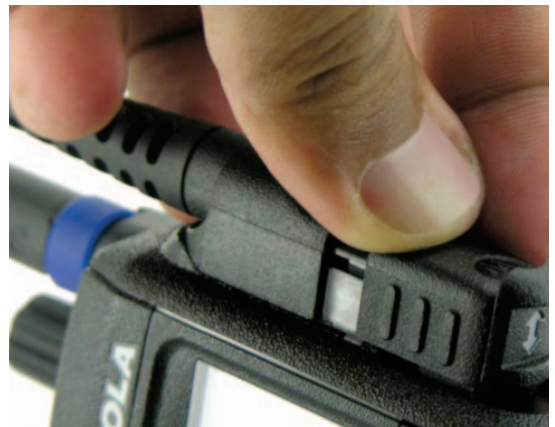
Connector can be detached with one hand in less than two seconds.