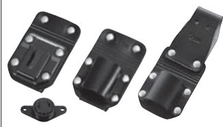
MB-96N MB-96F MB-96FL Swivel type Fixed type Long type