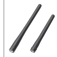
FA-S59V (Left) 150mm FA-S64V (Right) 115mm

Icom, Icom Inc. and Icom logo are registered trademarks of Icom Incorporated (Japan) in Japan, the United States, the United Kingdom, Germany, France, Spain, Russia, Australia, New Zealand and/or other countries. AQUAQUAKE and SUBMERSIBLE PLUS are trademarks of Icom Inc. (Japan). All other trademarks are the properties of their respective holders.