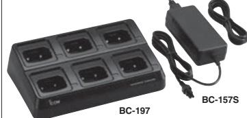
BC-197 BC-157S Charges up to six BP-245H in 3 hours (approx.). AD-129 is supplied with the BC-197, depending on version.