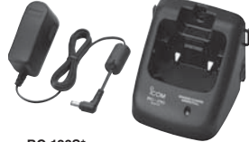
BC-123S* BC-210 Charges the BP-245H in 3 hours (approx.). * BC-123SA for 120V AC. SE for 230V AC.