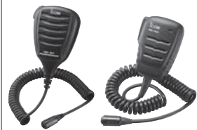
HM-167 HM-202 IPX8 rugged type IPX7 compact type