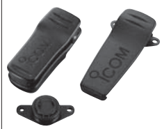
MB-86 MB-103 Swivel type Alligator type