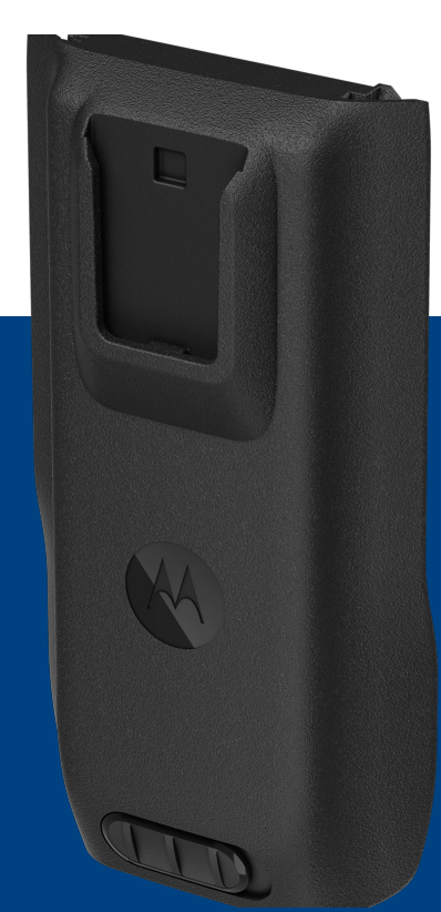
2900 mAh 3400 mAh