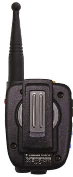
XLMC Standard long rotary shoulder mount clip