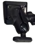
XMDM2 Mobile charger mounting arm