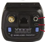
X10W Option 10 Watt speaker jack USB programming port PA/In-Car volume control