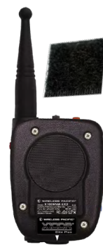
XVMC Velcro® shoulder mount option includes Velcro patch - for best shoulder placement