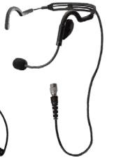
WPHFH-X10 Headset Industrial lightweight