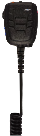
XTBM Talkback Microphone