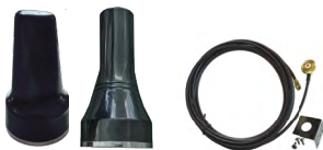
XMPA multipolarity roof/rack mount antenna kit