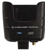
X10DR Elite Plus Gateway