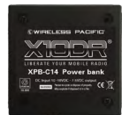
XPB-C14 In-line power bank Interface Box