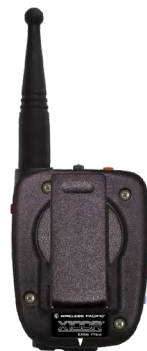
XNMC Non-metal rotary shoulder mount clip - Suit Electrical utilities