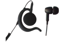
WPEH WPEB WPTEP