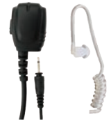
WPTRQ-X10 WPTEP-TL WPEB-TL WPEH-TL