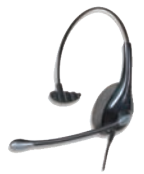
XLWH-X10 (in-line PTT not shown)