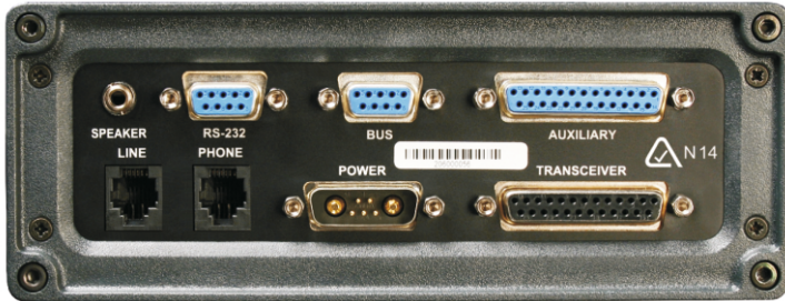
Barrett 2060 HF Telephone interconnect rear panel

98 pre-programmed telephone numbers stored in the 2060 can be accessed by HF manpacks, vehicles or base stations that only have Selcall and not the full dial Telcall option fitted.