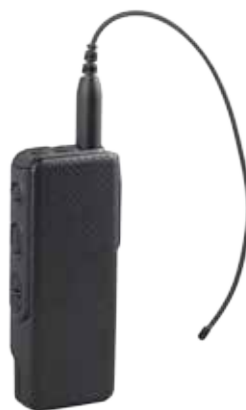
VHF FLEXI ANTENNA PMAD4125