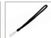
BC-123S* AC adapter FA-SC58V antenna MBB-3 belt clip Hand strap