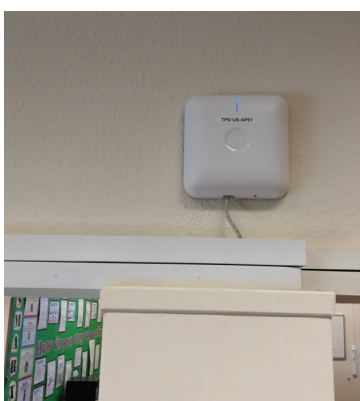
cnPilot™ e410 Indoor