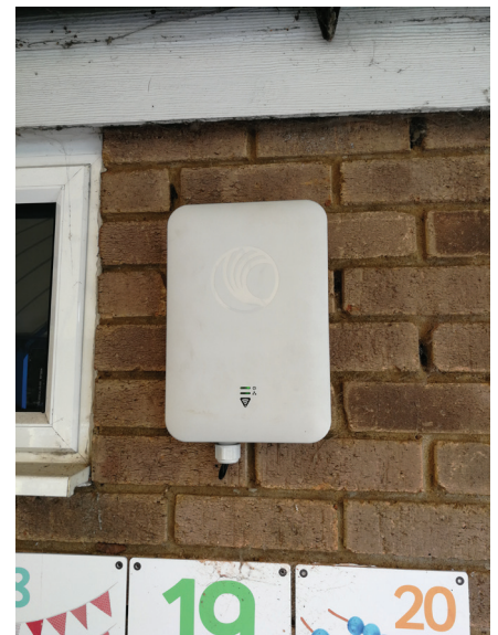
cnPilot™ e500 Outdoor

To further streamline the project, 5u installed Cambium Networks cloud-based end-to-end wireless management system cnMaestro™ to provide general support service provisioning and efficiently transfer management of the system. With cnMaestro's autonomous AP management, operations can be facilitated at the service layer – without compromising internet services – and provided the school with a solution that simply worked. Bench testing of the solution was carried out at 5u's pre-staging labs to ensure the solution could support the needs of the school before it was installed, making the transition as seamless as possible.