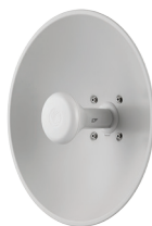
ePMP Force 200