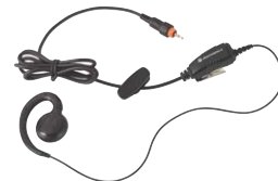
Earpiece with inline PTT button

This revolutionary, clean design provides rapid charging of your Motorola CLP. A Multi-unit charger allows you to conveniently charge up to six Motorola CLPs simultaneously. The charger is designed with a back pocket to store your earpiece while the unit is charging, and can be mounted on the wall if space is at a premium.