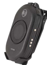
Swivel Belt Holster