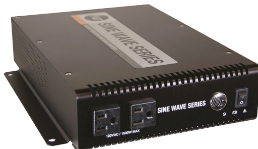
115 VAC Output Model Shown

1500 Watt DC to AC Pure Sine Wave Inverter for 115 or 230 Volt AC Applications