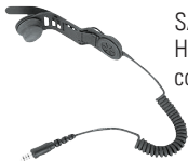
SAVOX HC-1 Helmet communications with bone conductive microphone and ear piece