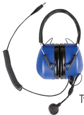
Twin Cup Headsets