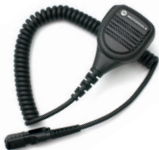
Remote Speaker Microphone