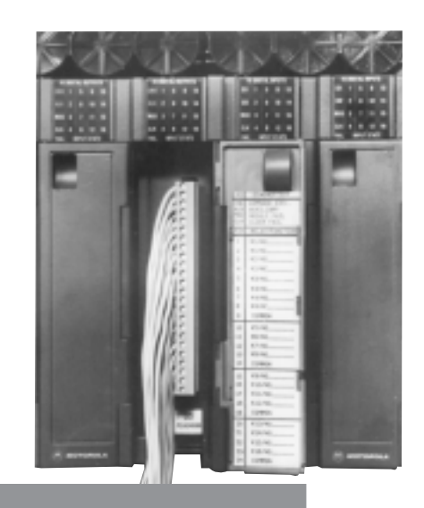
Plug-in I/O module showing LEDs and user connector

Rackmount with space for 7 I/O modules, expandable to 63