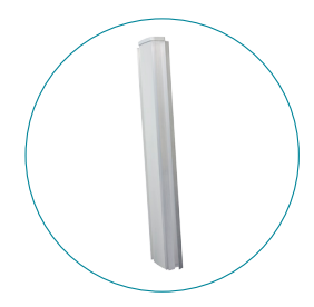
60 Degree Sector Antenna

At Cambium Networks, our antennas are engineered to address most typical network and terrain challenges and built to the highest level quality and reliability. The 2.4 GHz Access Point 60 degree sector antennas are specifically designed for use with the 2.4 GHz PMP 450 platform of products. As a result of their consistent front-to-back ratio in combination with power control and high gain, these antennas deliver optimized performance, including maximized spectral efficiency and easy installation.