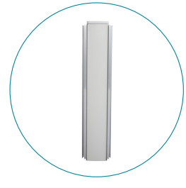
60 Degree Sector Antenna